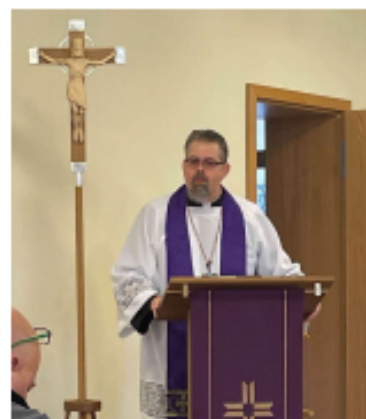
Here I am preaching at the Old Latin School Chapel for the Luther Academy meeting in Wittenberg, Germany. At this service, I was officially installed as a Theological Educator and missionary in the Eurasia Region.

First, an important meeting was held in Wittenberg, Germany between representatives from Concordia Seminary—St. Louis, Concordia Theological Seminary—Fort Wayne, the LCMS, the Evangelical Lutheran Church of Latvia and Luther Academy. The purpose of this meeting was to establish a stronger relationship between the organizations. This relationship is important for the future of Luther Academy and the accreditation process in the European Union. I'm happy to report the result of the meeting was very positive, and we are hoping to take the steps necessary to rejoice in our common confession for the foreseeable future.