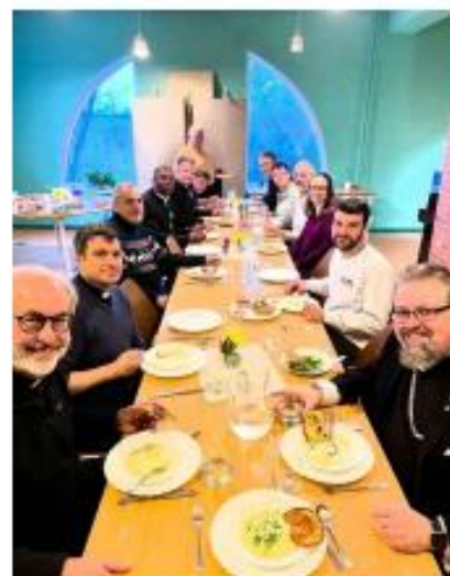
Students, lecturers and guests take time out for food and fellowship during Intensive Studies Week at Luther Academy in Saldus, Latvia.