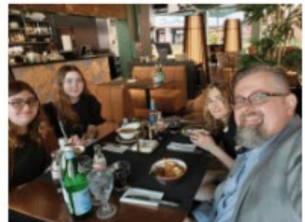
My family and I at lunch after going to church in Old Town, Riga on July 10, 2022.

As you read this newsletter, my oldest daughter will have already gone back in the U.S. It will most certainly be a time of transition for her and for her parents. Please continue to keep all of us in your prayers as we experience this milestone.