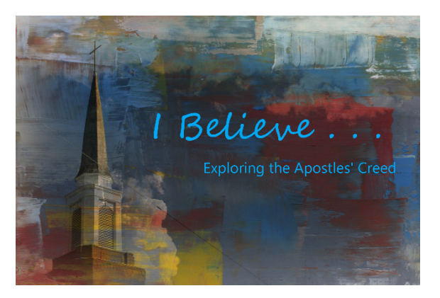
Credo: The Work of The Holy Spirit

As we come to the Third Article of the Creed we come to the portion which is often glanced over due to the time spent on the Second Article and the Person of Christ. I confess that I am guilty of this in my own teaching. It is for a good reason but I would like to offer a corrective here in this article, as poor as it might be.